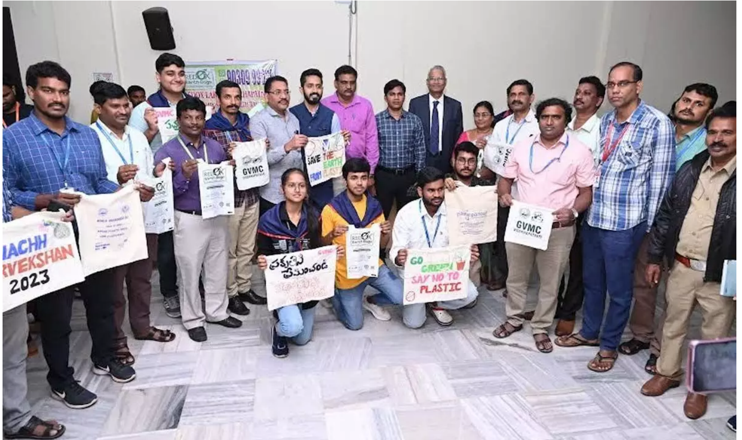
Displaying placards, students taking part in a plastic awareness programme at the campus in Visakhapatnam on Tuesday